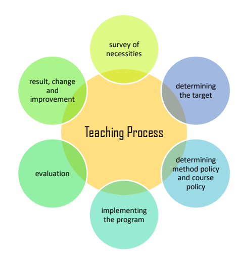
Chart (3): Teaching Process Template, (Lutfabadi, 1386, p. 29)