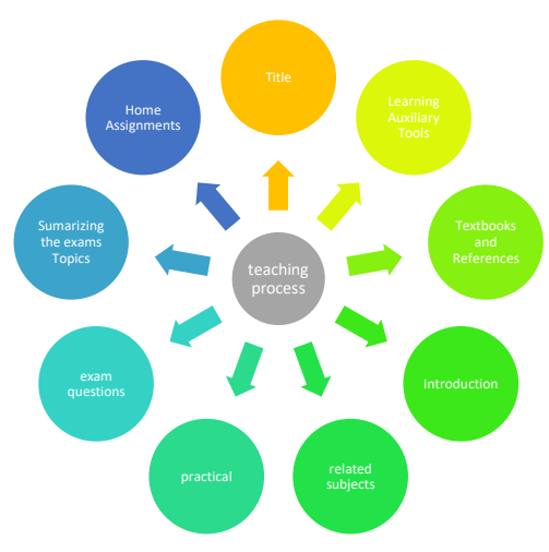
Chart (4): Process of Lesson Plan

The answer to the next question is quantitative to the teachers that, in the teaching process according to the nature of the subject and the teaching materials, which of the teachers and students should display specific activities, and how and how the quantity and quality of these activities should be done by the teachers. Adjust before starting the lesson. Finally, the answer to the last question provides teachers with this context, which informs them of reaching the goals. That is, they determine the evaluation methods of the lesson in advance (Molki, 2013). Diagram number (4) shows the lesson plan process.