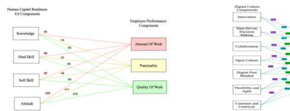
Figure 1. Conceptual Framework Human Capital Readiness