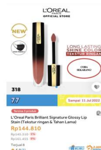
Figure 4. Proposed Virtual Try-On Feature on Blibli App