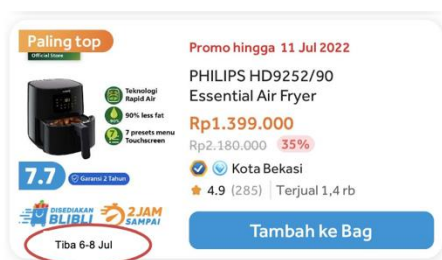
Figure 3. Proposed Product Arrival Information Display on Blibli App

Here are the implementation of UI enhancement initiatives proposed by the author: