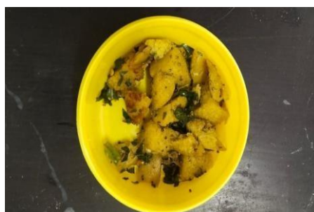
Figure 3 – Sample C selected as Best Variant