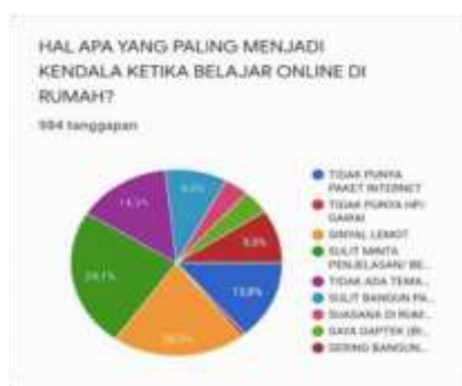
Figure 1 online learning survey of SMP N 10 Surabaya during the Covid-19 Emergency

Learning during the Covid 19 period in Junior High Schools in Indonesia that occurred online during the Covid 19 period made various parties to be more creative in their implementation. However, there are various problems that arise due to online learning during the Covid 19 period. Based on the online learning survey of SMP N 10 Surabaya during the Covid-19 Emergency which was carried out on 9 – 11 April 2020 on 984 students out of a total of 1401 students, using google form shows that the main thing that becomes the main obstacle in online learning during the Covid-19 Emergency is the limited signal. The survey results can be described as follows: