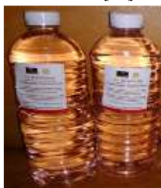
Figure 1. Nanogold-Nanosilver Health Drinking Water

The results of the synthesis were nanogold and nanosilver with a concentration of 20 ppm which were diluted to a concentration of 2 ppm by means of 100 mL of nanogold inserted into a 1000 mL bottle, then added water up to 1000 mL. The same treatment was also carried out for nanosilver. After that, each nanogold and nanosilver with a ratio of 4:1 were mixed homogeneously and put in a 1000 mL or 1 L bottle labeled as Health Drinking Water. Nanogold and nanosilver were tasteless and non-toxic colloids. Nanogold and nanosilver are safe to drink [21].